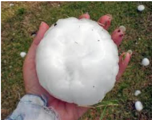
Baseball-size hailstone from a storm that struck St. Louis in April 2012.

The insurance claims took weeks to handle and repair work went on for months: 120,000 home claims, 65,000 auto claims and 8,000 commercial claims were submitted. Considered the most costly hailstorm in U.S. history, known insurance losses totaled $2 billion, according to the Missouri Department of Insurance.