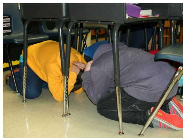
Each year schools across Missouri participate in the ShakeOut drill.