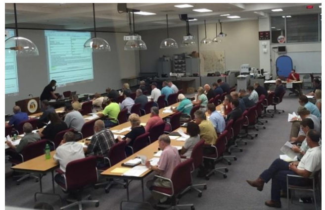
First public assistance applicant briefing held on Aug. 14 at the State Emergency Operations Center, Jefferson City.

Ice Storm Warnings – Ice accumulations of a quarter-inch or more are expected.