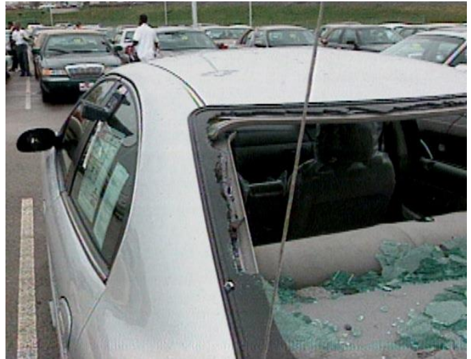
St. Louis-area auto dealerships reported severe hail damage from an April 2001 storm.

In the St. Louis area, virtually every home and business in northern St. Louis County sustained some hail damage. In addition, the hundreds of newly built vehicles parked outside the Ford Motor Company assembly plant in Hazelwood were damaged, as were 24 commercial and military aircraft at Lambert-St. Louis International Airport. Area auto dealerships were also blasted by the large hailstones that pulverized vehicle windshields, siding and roofs.