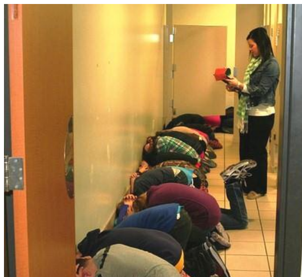
Fourth graders at Ashland, Mo.'s Southern Boone Elementary School shelter in an interior restroom during Missouri's Statewide Tornado Drill on March 6, 2014.

"CDC has not released the process for determining which counties will still require a TAR," said Friel. "We will share the exact methods for conducting local TARs as soon as the details are available. The state will still be required to complete a CDC-conducted TAR."