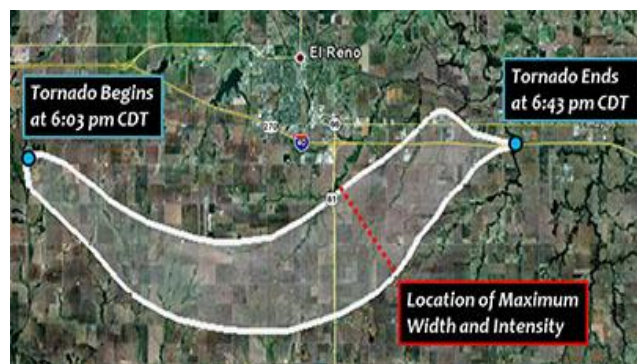
Track of May 31, 2014 El Reno Tornado.

Eleven days after the Moore tornado, what would become a 2.5-mile wide tornado – the widest ever recorded – formed near El Reno, Okla. It remained over mostly open terrain and did not impact many structures, but it will be infamous for two key reasons beyond its size: four storm chasers were among the eight people it killed (all eight fatalities were in vehicles); and the evening rush hour traffic in Oklahoma City that is reported to have included people who were trying to outrun it. Interstates 35, 40, 44 and 240 were reported to have been "parking lots."