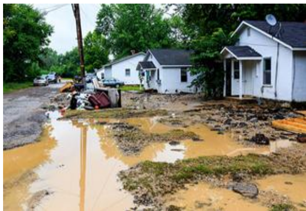
Waynesville was one of the Missouri communities hit hard by deadly flash flooding in August 2013.