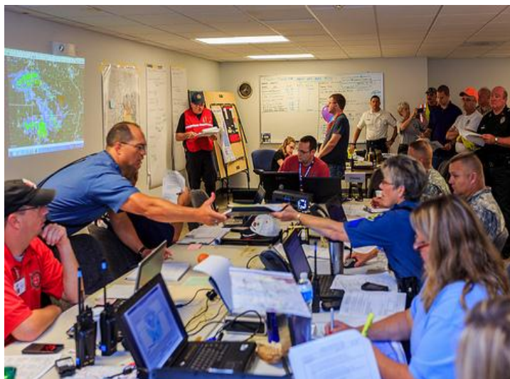
The Pulaski County Emergency Operations Center was activated in response to August 2013 flooding.