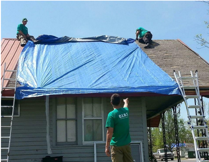
MOCERT1 team members work on a roof damaged by a tornado in Baxter Springs, Kan.

The MOCERT1 team members were housed at the Miami, Okla., Church of Christ. All 28 members slept in one large room and shared two showers. McDonald County's emergency management agency arranged cots from the local Red Cross. One of the key components of a MOCERT1 deployment is flexibility. Our motto is "adapt and overcome."