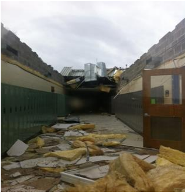
Orrick High School after the May 10 EF-2 tornado.