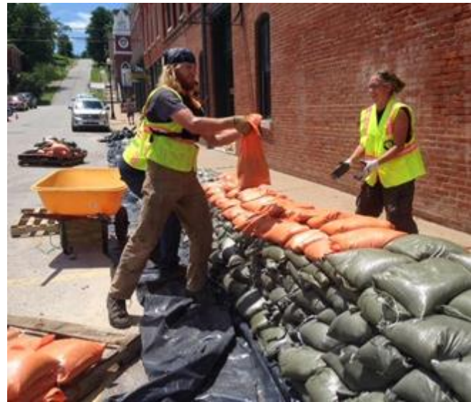
Volunteers add sandbags to flood barriers in Clarksville in July 2014.

With Clarksville threatened, local responders reached out to SEMA and other partners. Within hours, an all-out effort was launched to build sandbag barriers in the areas of Clarksville that have been vulnerable in past flooding.