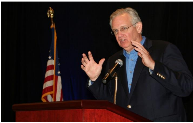
Gov. Nixon addresses the 2014 Missouri Emergency Management Conference in St. Charles.