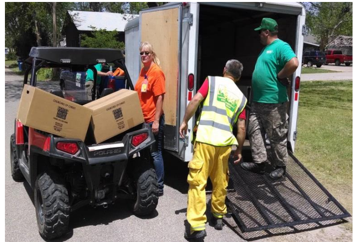
MoCERT1 team members unload supplies during a deployment to Baxter Springs, Kan.