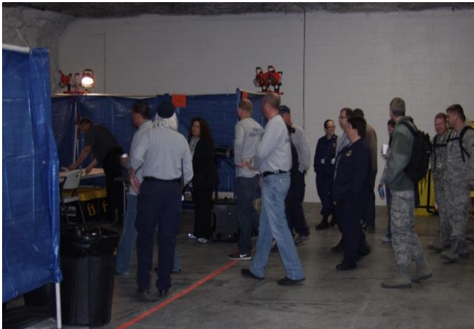
Responders enter the mobile morgue for training during a mass fatality exercise conducted May 8-11 in Kansas City.