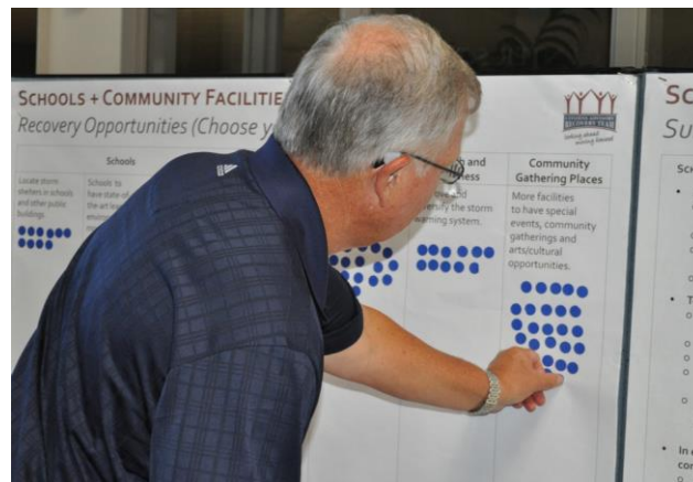
A Joplin resident votes on recovery project priorities during a public meeting in August 2011.