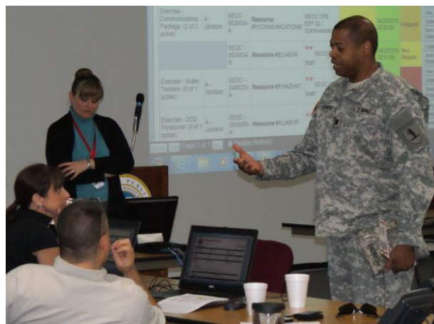
The Missouri National Guard, federal, state and local agencies participated in the Vibrant Response exercise in May.