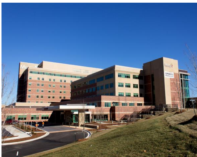
Mercy Hospital Joplin on a new site after the old St. John's Regional Medical Center was destroyed by the 2011 tornado. The new hospital opened on March 23, 2015.