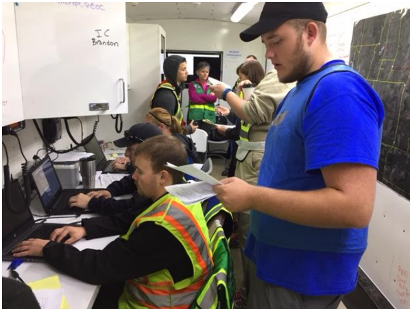
Students from NWMSU's emergency disaster management program coordinate response efforts during the 2016 Missouri Hope exercise, Oct. 7-9 in Nodaway County.

The 2016 Missouri Hope exercise drew about 500 participants, including students, educators, volunteers and professionals. Joining the NWMSU students were students from similar programs at other Missouri colleges, as well as students from New York, Washington D.C., Michigan and North Carolina.