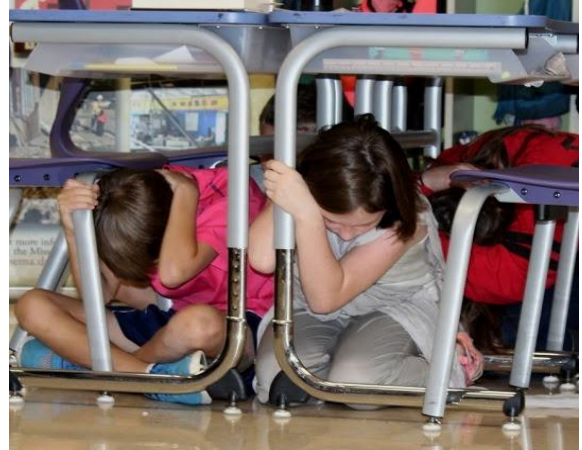
Fifth graders at East Elementary School in Jackson participate in the Oct. 20 ShakeOut drill.

More than 550,000 Missourians were among 2.96 million people in 14 states participating in the 2016 Great Central U.S. ShakeOut earthquake drill on Oct. 20. This year's participation was the second highest ever in Missouri. The record was set in 2013 with a statewide participation of 583,909.