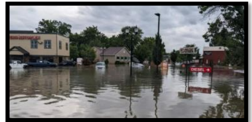
NWS St. Charles, Mo

We're always looking for flooding photos, elevated structure photos, projects demonstrating stormwater management techniques and "green" projects, so please share them with us! Be sure to include your name, the location, and the date of the photo. Send photos to: karen.mchugh@sema.dps.mo.gov