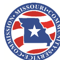
Missouri Community Services Commission