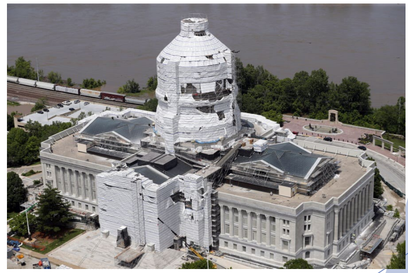
Jefferson City 2019