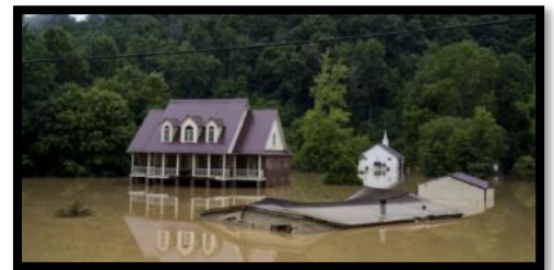
noaa.gov: Breathitt County, Kentucky July 2022

We're always looking for flooding photos, elevated structure photos, projects demonstrating stormwater management techniques and "green" projects, so please share them with us! Be sure to include your name, the location, and the date of the photo. Send photos to: karen.mchugh@sema.dps.mo.gov