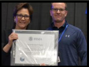
Maryland Heights receives its CRS Class 8 plaque.