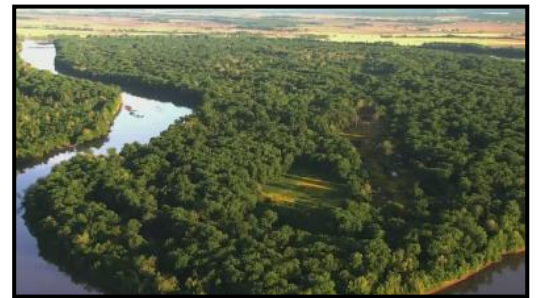
Pelican Island Natural Area, North St. Louis

We're always looking for flooding photos, elevated structure photos, projects demonstrating stormwater management techniques and "green" projects, so please share them with us! Be sure to include your name, the location, and the date of the photo. Send photos to: karen.mchugh@sema.dps.mo.gov